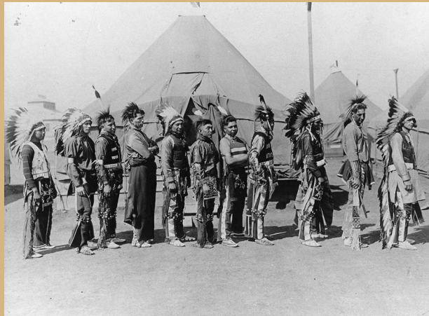
The 45th Infantry Division